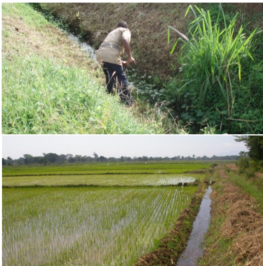
Figure A6.1. A drain (top) and an irrigation canal (below) near Moshi, United Republic of Tanzania

A large-scale molluscicide trial was conducted on a sugar estate near Moshi in the United Republic of Tanzania for the control of aquatic snails Biomphalaria pfeifferi and Bulinus spp. (Crossland, 1963). The test site consisted of five parallel irrigation canals (Figure A6.1) of approximately 1 m wide and 500 m long, with facilities for controlling the flow of water (Fenwick, 1970).