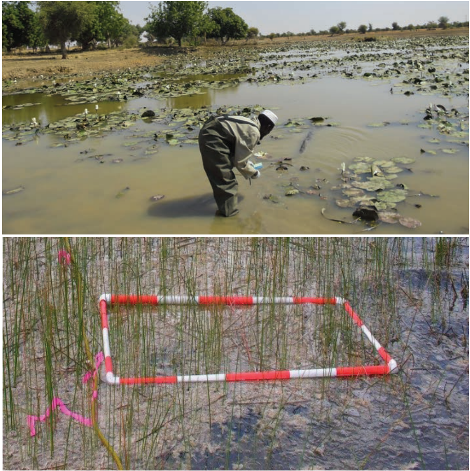
Figure 4.1 Sampling of aquatic snail species in a pond (above); and quadrat sampling of amphibious snail species using a metal frame (below)