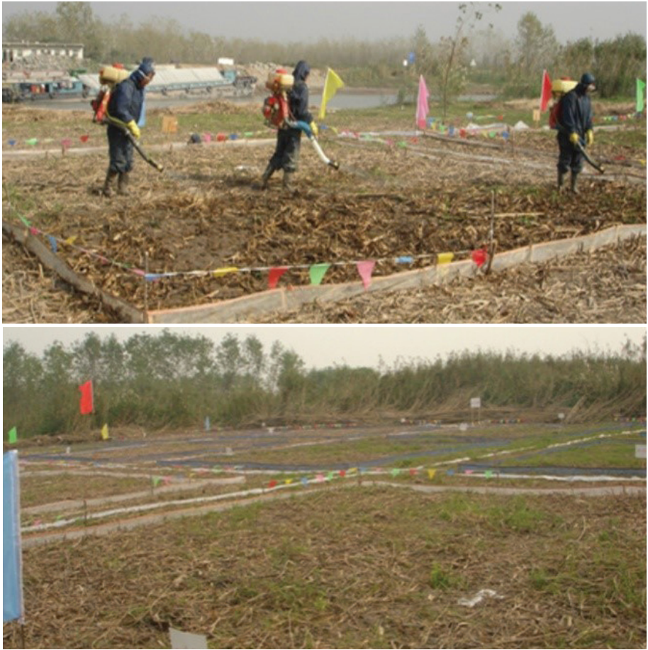
Figure A6.2. A marshland divided into 100 m 2 plots for testing molluscicide against amphibious snails of Oncomelania spp.